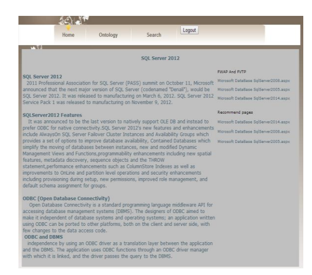
Fig 3.7 Recommends on Frequently accessed and viewed page

After that click the search option give some related keyword of domain then some related option will display, in that select particular option it display then information about that pages.