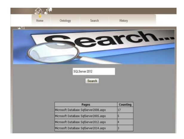
Fig 3.4 Searching webpage of recommends process

Here we entering given domain page of related keywords it will display click any option on the related pages, and then it displays the information about required pages.